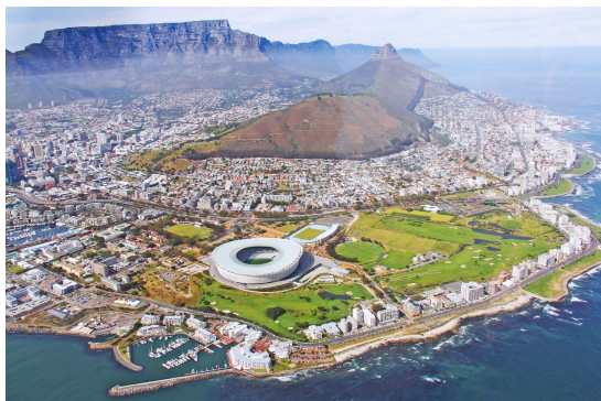
Cape Town, South Africa