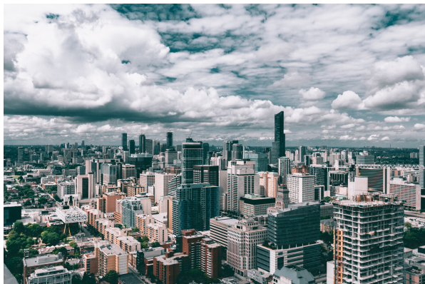
Mexico City, Mexico